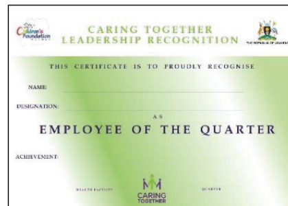
Employee of the Quarter Certificate