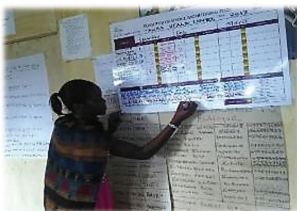
Data for Decision-Making