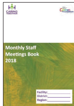
Monthly Staff Meetings Book