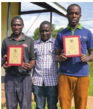
World AIDS Day Awards