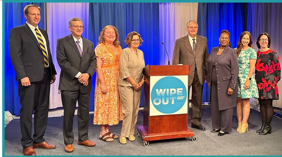
Operation Wipe Out Partners at the launch of the Strategic Action Plan for Cervical Cancer Elimination as a Public Health Problem in the State of Alabama, May 8, 2023.

We also initiated research seeking to better understand barriers to increasing European engagement in global cervical cancer prevention efforts, as well as where opportunities to more effectively utilize pooled procurement to reduce the costs of HPV diagnostics might expand access and support the WHO's 70% screening goal.