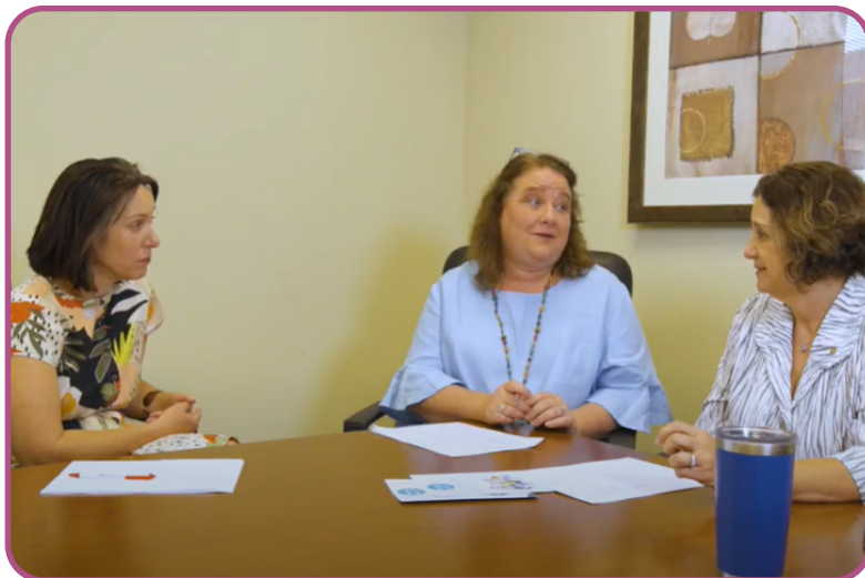
Leadership of Operation Wipe Out (TogetHER for Health, Alabama Department of Public Health, and the University of Alabama at Birmingham) in the TogetHER for Health promotional video.

In addition to the members of TogetHER, we would like to thank our collaborating partners and supporters, including Panorama Global, Rotary International, the University of Alabama at Birmingham, the Alabama Department of Public Health, AL Dept of Public Health, Rotary Clubs of Birmingham and of LaFayette County, Hologic, Roche, the Women to Watch Foundation, Maverick Collective, Cervical Cancer Action for Elimination, Cervivor, Colectivo, Scope Impact, the Tiba Foundation, the Matibabu Foundation, Conquering Cancer, and all of the organizations who share TogetHER's commitment to the global elimination of cervical cancer.